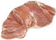
Butterflied Leg (Broil, Grill, Roast)