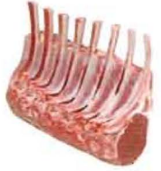
Frenched Rib Roast (Broil, Grill, Roast)