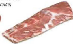
Spareribs (Denver Ribs) (Braise, Broil, Grill, Roast)