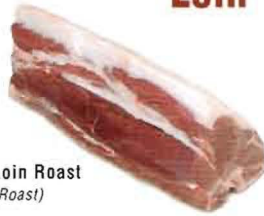
Loin Roast (Roast)