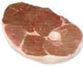
Center Cut Leg Steak (Broil, Grill, Panbroil, Panfry)