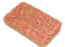
Ground Lamb (Broil, Grill, Panbroil)