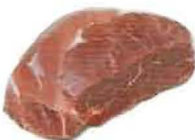
Top Round (Broil, Grill, Roast)