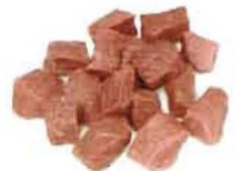
Lamb for Stew (Braise)