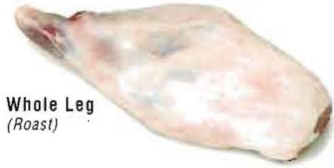
Whole Leg (Roast)