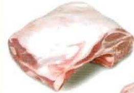
Square Cut Shoulder Whole (Braise, Roast)