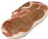
Sirloin Chop (Braise, Broil, Grill, Panbroil, Panfry)