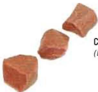
Cubes for Kabobs (Braise, Broil, Grill)