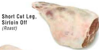
Short Cut Leg, Sirloin Off (Roast)