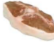
Double Loin Chop (Broil, Grill, Panbroil, Panfry)