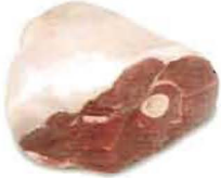
Center Leg Roast (Roast)