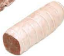
Double Boneless Loin Roast (BRT) (Roast)