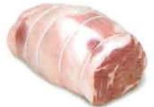
Boneless Shoulder Roast (BRT) (Braise, Roast)