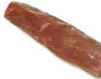
Tenderloin (Broil, Grill, Roast)