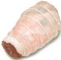
Boneless Leg Roast (BRT) (Roast)