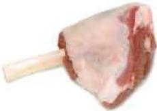
Frenched Hindshank (Braise)