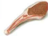
Rib Chop (Broil, Grill, Panbroil, Panfry, Roast)